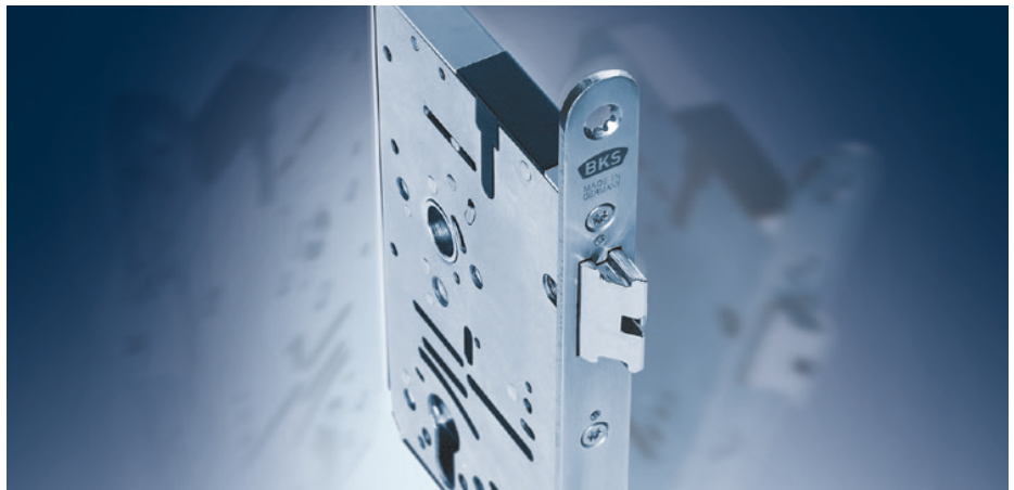
The famous panic lock